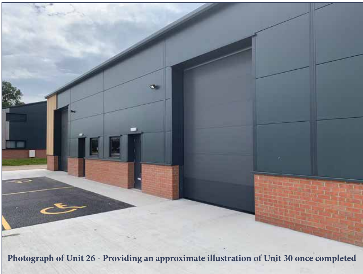
Photograph of Unit 26 - Providing an approximate illustration of Unit 30 once completed

FM Fordy Marshall LAND & PROPERTY CONSULTANTS