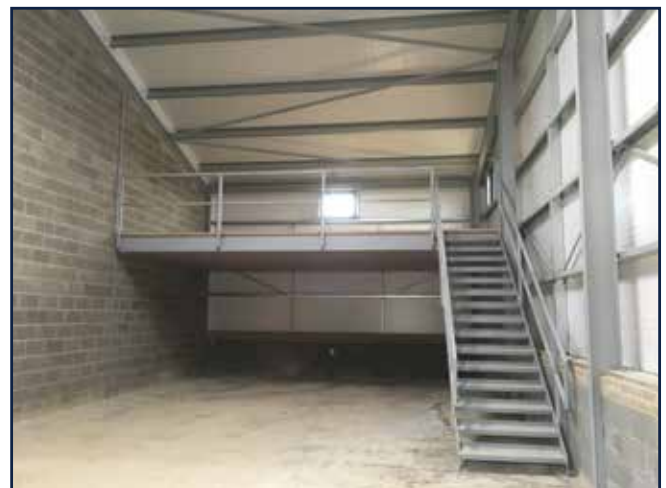
Photo of Unit 26 - illustrating the specification of Unit 30 once completed.