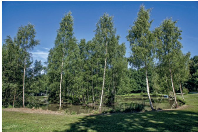
Great Wood Eco Lodge, Smith's Lane, Flaxton, York, YO60 7QT