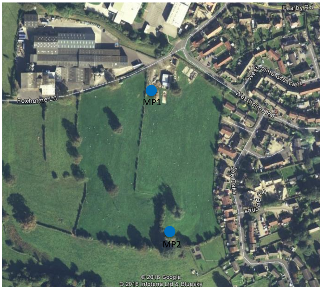
Figure 1: Monitoring Locations

3.2 Numerous handheld measurements were also recorded of the typical activities that occur in and around the mill on the 25th January 2017, with particular focus on the noisiest activities. These were undertaken on the side of the mill where noise would potentially have the worst impact upon the proposed residential development.