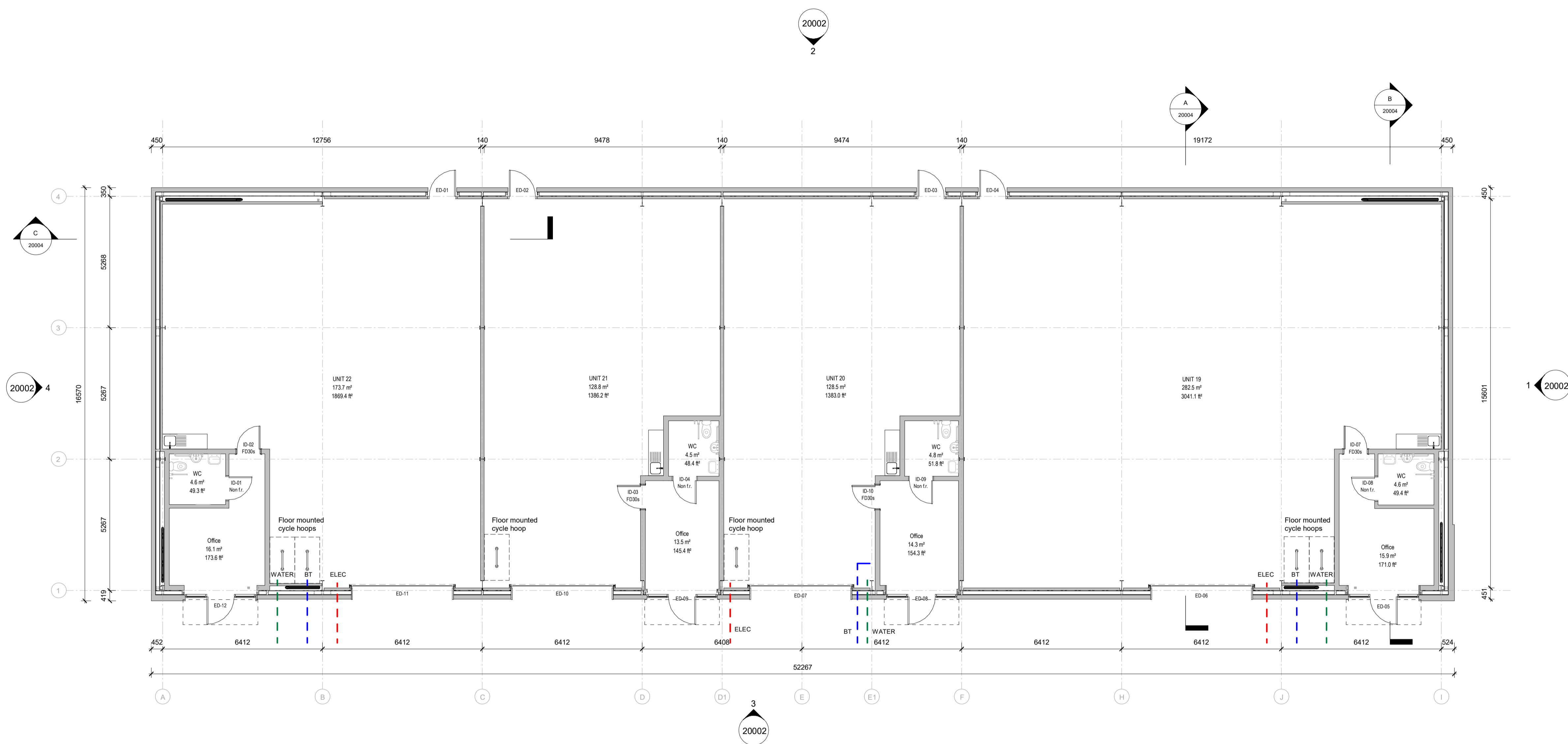
1 GA Floor Plan 1 : 100