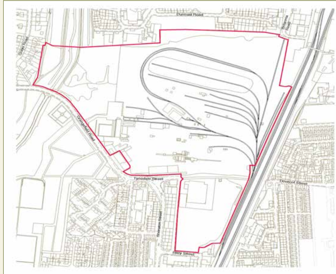
Plan for Identification Only. Not to Scale

If you require this publication in an alternative format, please contact Fordy Marshall on 01937 918 088.